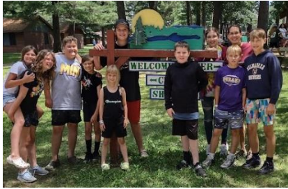
Luther Park Bible Camp