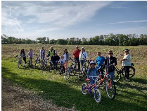
The Rock Creek Riders

The first ever Bike Blessing was a great kick-off to summer on May 21 st