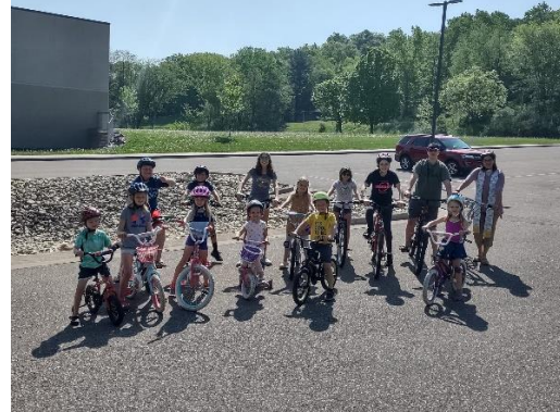
The Faith Fleet