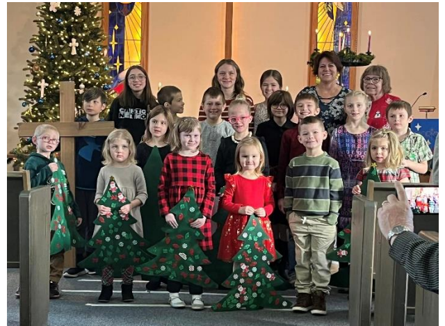
Faith Christmas Program