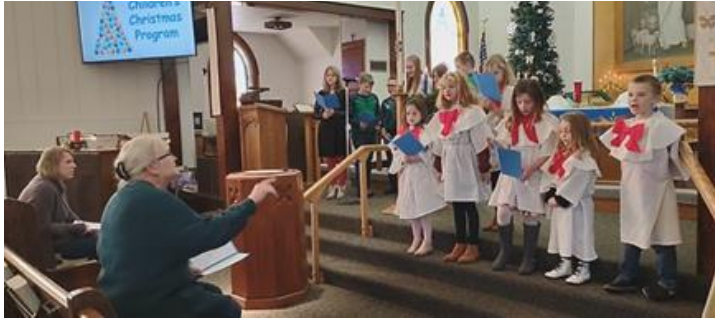
Rock Creek Christmas Program