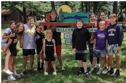
Luther Park Bible Camp

Both Faith and Rock Creek are part of the congregations that make up the Dairyland Conference within our synod. All are welcome to join area pastors and lay leaders for the annual meeting to be held on Thursday, February 19 7PM at Immanuel Lutheran Church in Pepin.