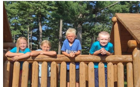
Our Partnership with Holy Play