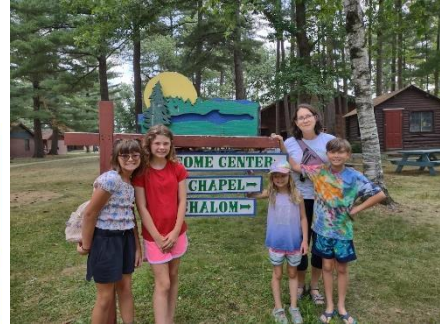
Our Partnership with Holy Play