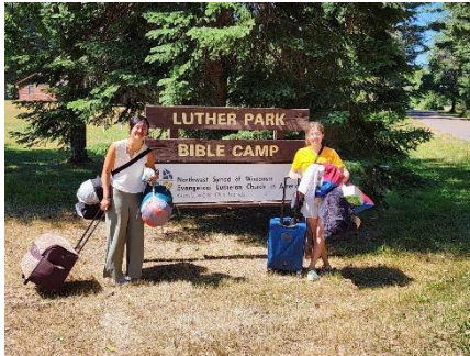
Luther Park Bible Camp